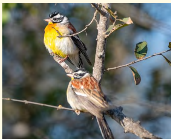
The Golden-breasted Bunting (Rooirugstreepkoppie)

(Bosveldfisant) or Swainson's francolin is native to Southern Africa. In the Shona language in Zimbabwe, this bird is called the Chikwari.