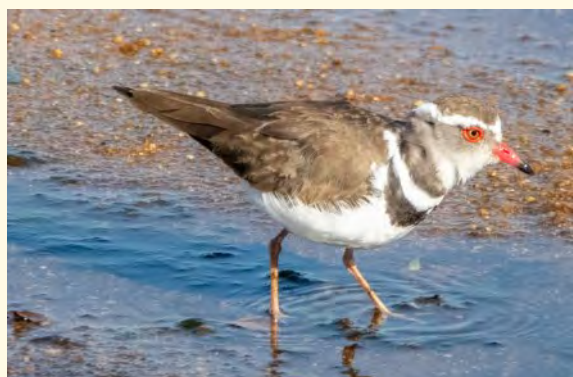
The Three-banded Plover

(Witkoluil) is a small bird of prey found in sub-Saharan Africa.