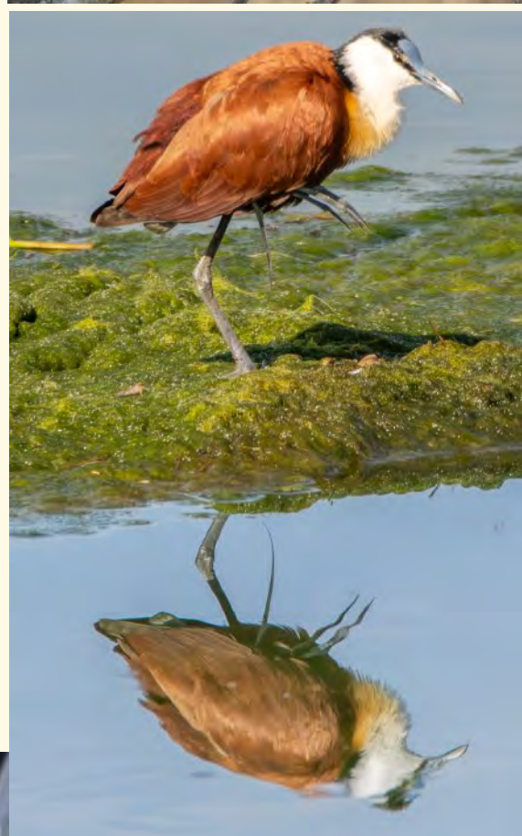
The African Jacana

(Driebandstrandkiewiet) is a common and widespread species of wading bird, found over most over most of the southern half of Africa .