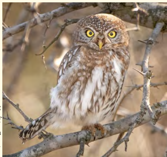
The Pearl-spotted Owlet

(Troupant) is an African bird, widely distributed in Southern and Eastern Africa. It prefers open woodland and savanna.