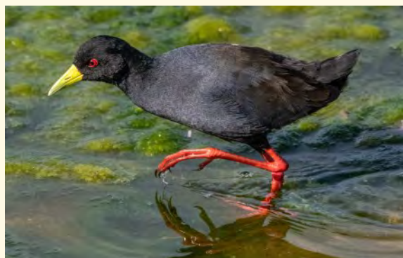
The Black Crake

(Grootlangtoon) is a wader and has long toes and claws that enables it to walk on floating vegetation in shallow lakes, its preferred habitat.