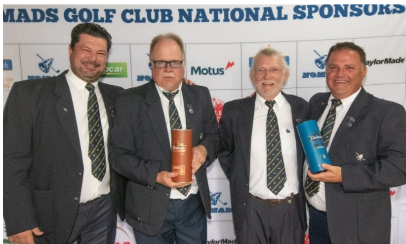
Glenbrynth Whisky Draw (from left to right)