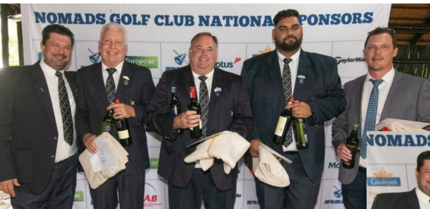
Winning 4-ball were (f.l.t.r.):